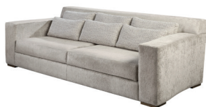
Malcolm II (sofa)