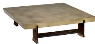
Webwood (coffee table)

Design Fabrice Ausset L 150 – P 113,5 – H 48 cm